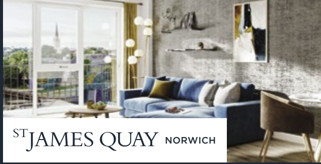
ST JAMES QUAY NORWICH